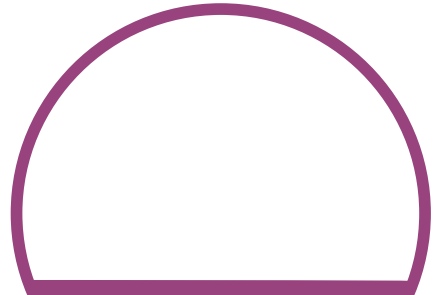
GAS NO GAS