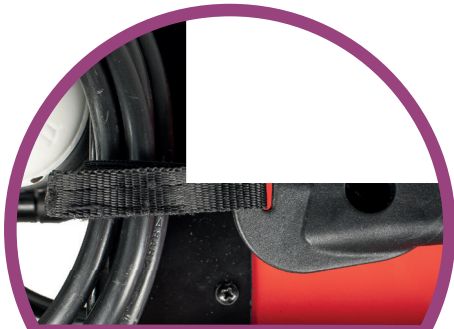
REAR CABLE WRAP HOLDER